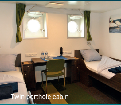
Twin porthole cabin